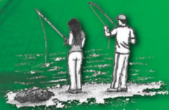
Have good relations without sex (Abstinence)