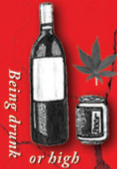
Being drunk or high