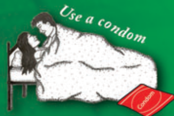
Use a condom

For more information on sexual health go to your CLSC