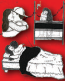
A lot of sexual partners