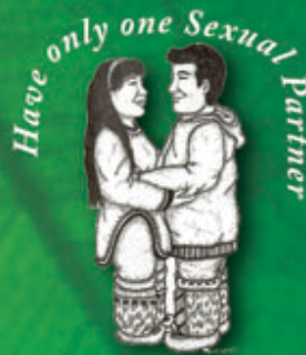
Have only one Sexual Partner