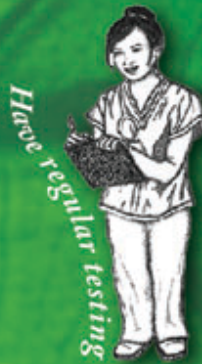
Have regular testing